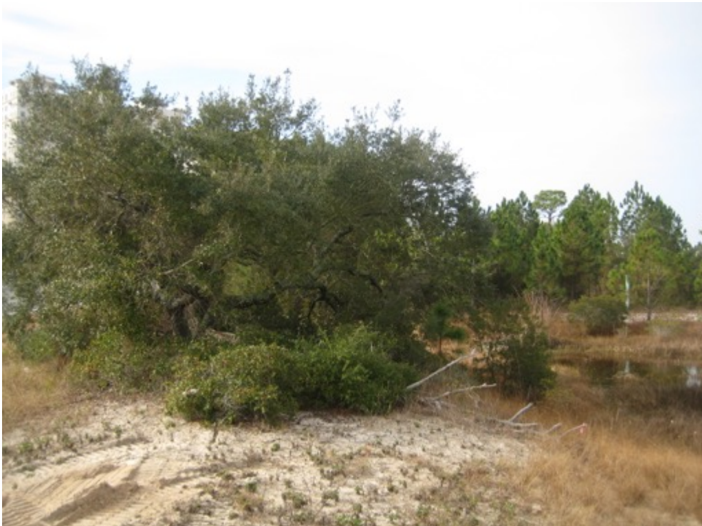
Photo 2 Looking southwest along eastern boundary