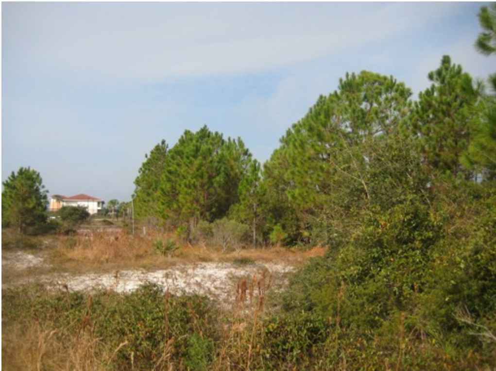
Photo 4 Looking west along southern property boundary