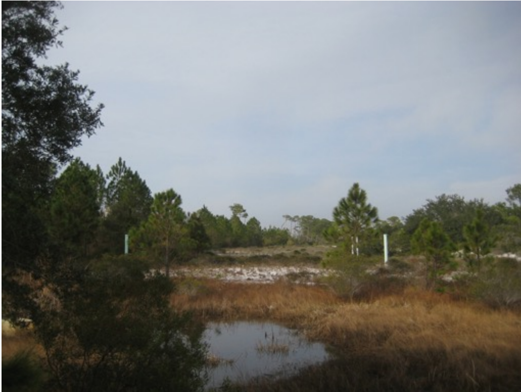
Photo 5 Looking west through eastern portion of site