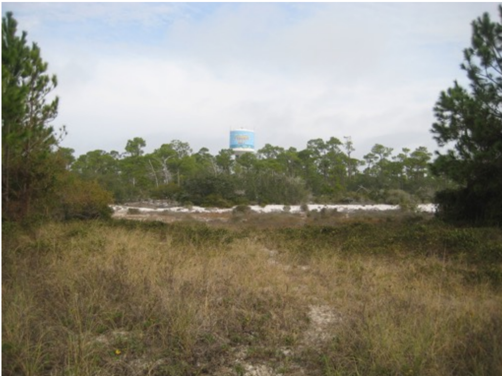
Photo 8 Looking north through western portion of property