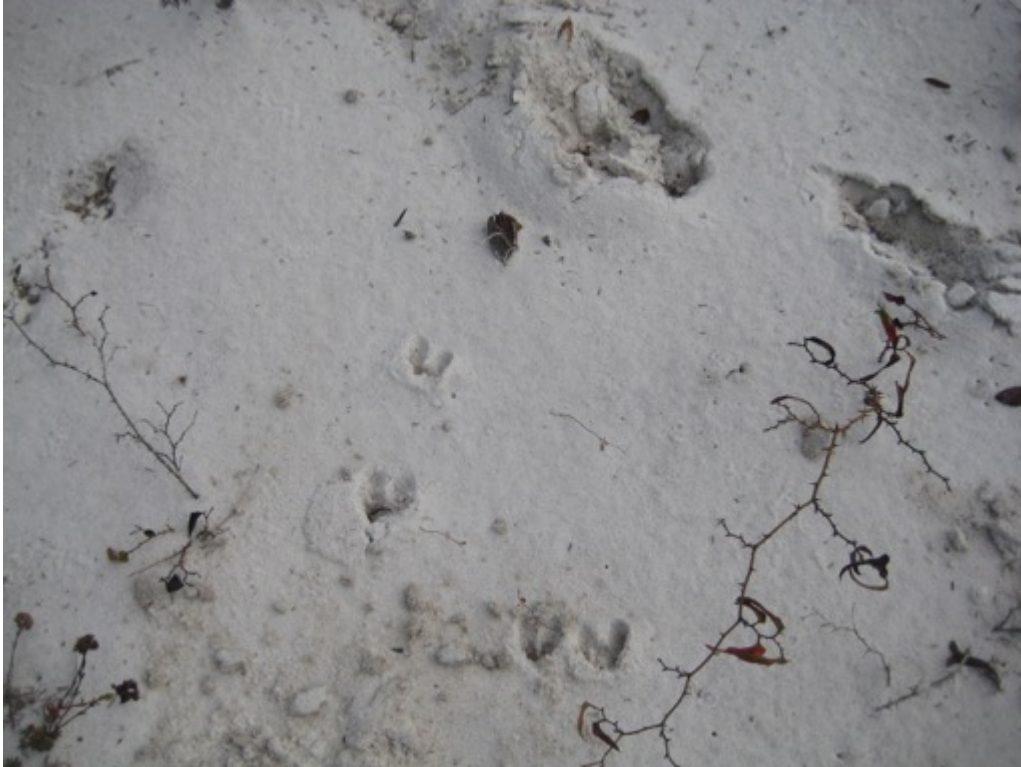
Photo 11 View of deer tracks that are abundant on the site