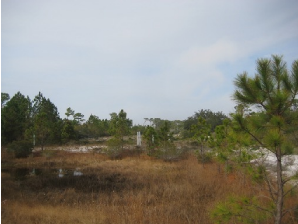
Photo 1 Looking west along northern property boundary