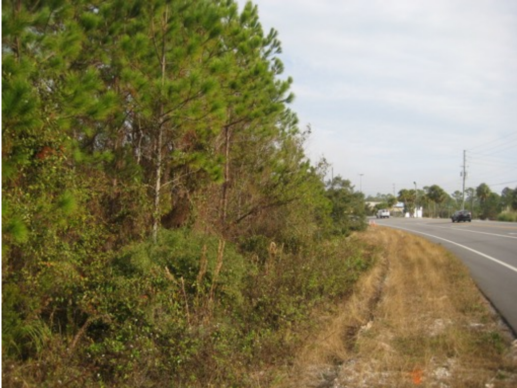
Photo 3 Looking northeast along eastern property boundary