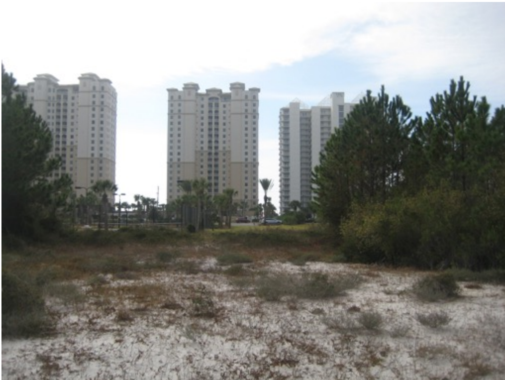
Photo 10 Looking south through western portion of property