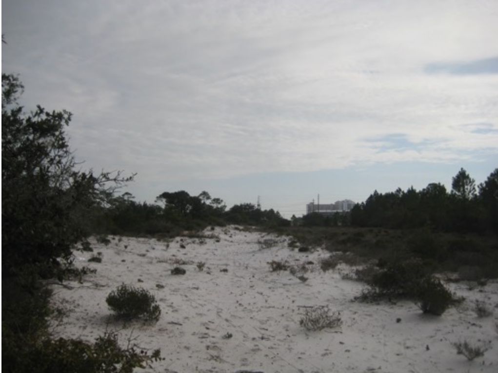
Photo 9 Looking east along northern property boundary