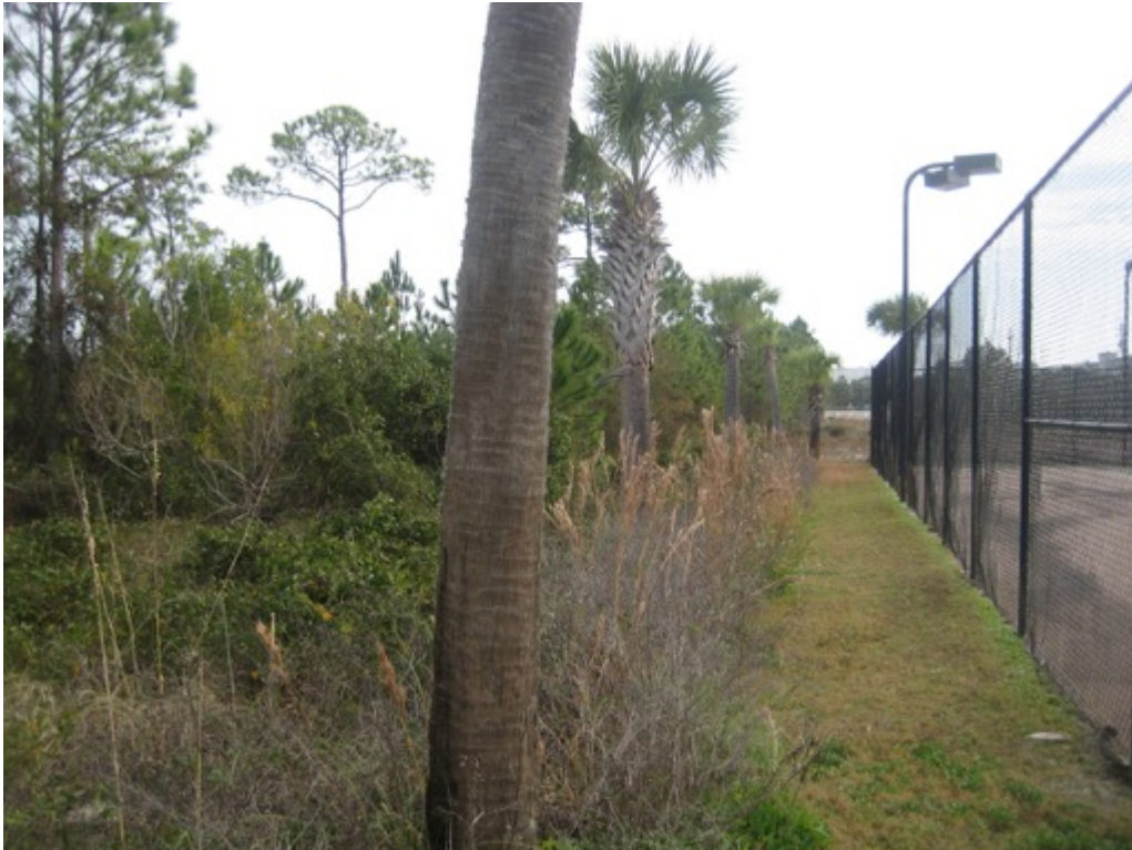
Photo 7 Looking east along southern property boundary