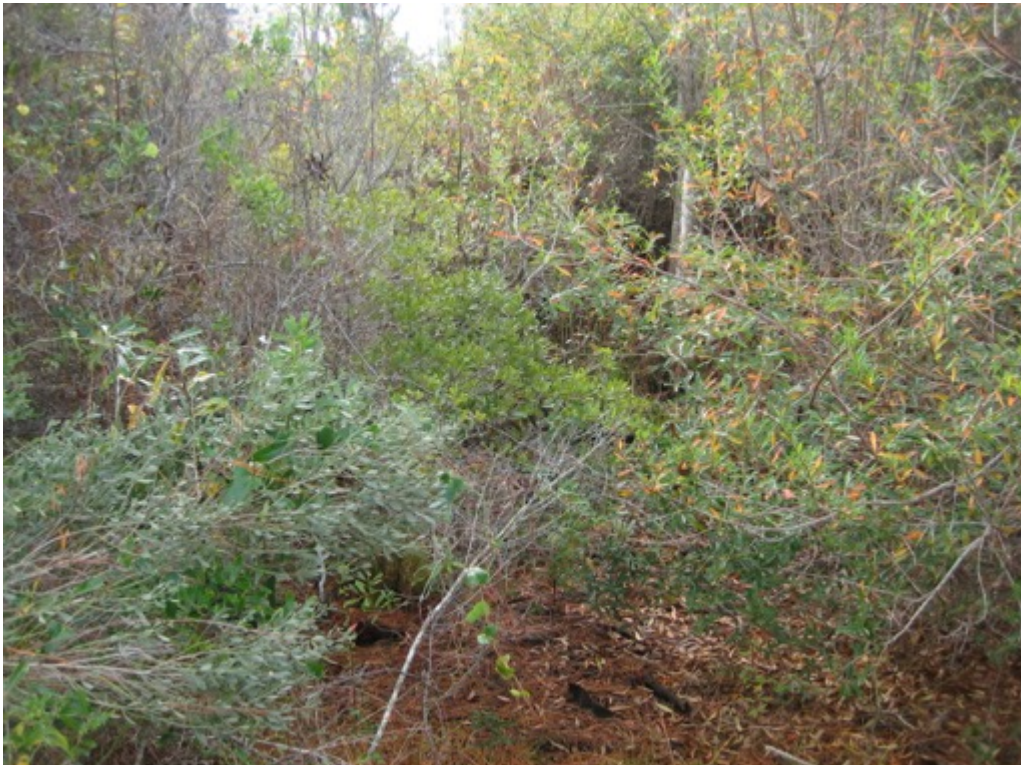
Photo 6 View of intra-dunal swale wetland from the northwest